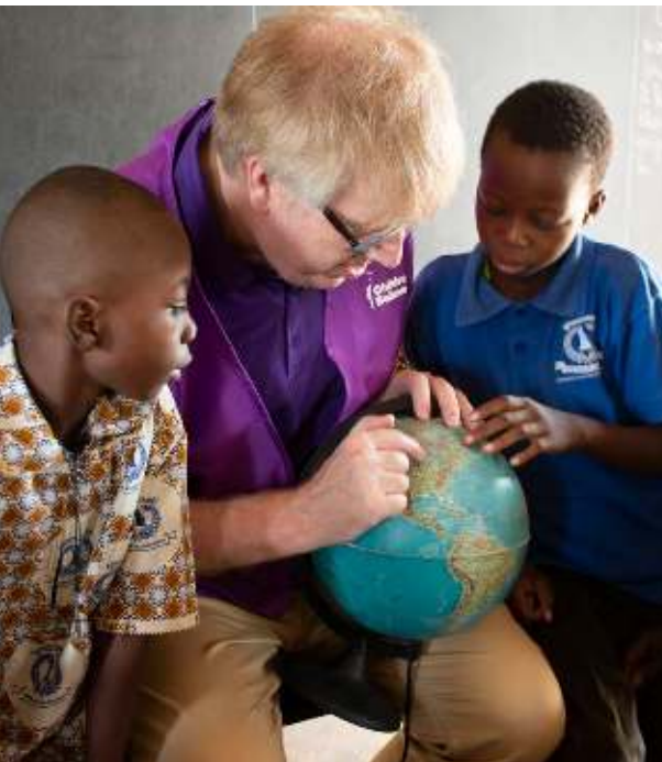
© Meeting with children in a classroom in Burkina Faso. Photo: Karen Homer