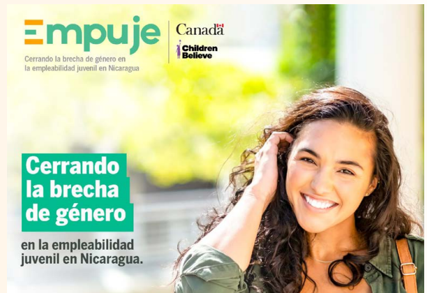
🕒 The Empuje project slogan is "Closing the gender gap in youth employability in Nicaragua", translated from Spanish.

Funded by the Government of Canada and Children Believe, EMPUJE supports youth in nine Nicaraguan provinces. The project will increase employability among young people by providing them with technical knowledge and skills relevant to today's work environment, as well as to encourage entrepreneurship.