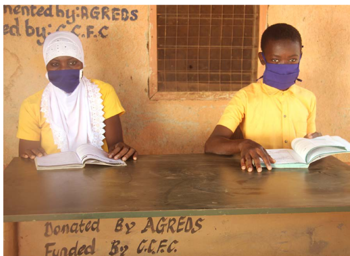
⌚ Some students do schoolwork while listening to announcements.

After only a few months, the new announcement system has become so effective it is now used by The Ghana Health Service, Ghana Education Services, The Ministry of Agriculture and other development agencies.