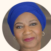
Phumzile Mlambo-Ngcuka, Executive Director, United Nations Women