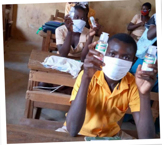
⊕ Students in Ghana have received face masks and hand sanitizer to help ensure student and teacher safety in class.

We are focusing efforts on ensuring the safe return of children to schools; preventing violence against children and women; restoring livelihoods, and helping communities recover from economic shocks. We're working to stop the spread; ensure children are nourished; keep them safe from violence; and help children continue learning, despite the fact that many schools remain closed.