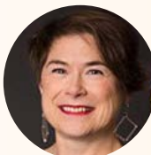
Leslie MacLean, Deputy Minister of International Development, Government of Canada