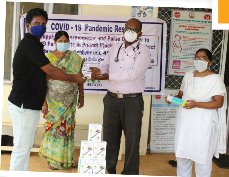
Ⓐ A health clinic in India received thermometers and other PPE to help staff provide better care for the community.

Hear from youth on our YouTube channel bit.ly/CB-covid19-update