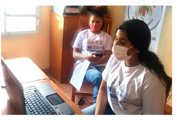
⊕ In Paraguay, some students receive assistance to connect to online classes, when needed, when Internet or computers become a barrier to learning.

Ethiopia: Hygiene education is at the top of efforts to help rural and semi-urban schools and communities avoid the spread of the virus. So far this year, 31,756 students have been reached in schools with awareness messages to help stay safe from COVID-19.