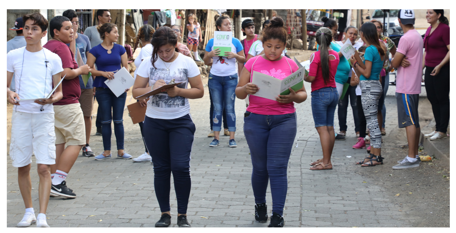
Youth lead the design and implementation of community campaigns to share awareness-related messages about the risks of irregular migration in schools and other community centers.