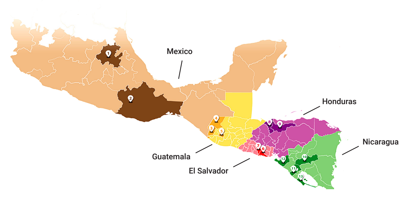
DIAGRAM 1: PICMCA'S REGIONAL SCOPE AND THE AREAS OF IMPLEMENTATION IN CENTRAL AMERICA AND MEXICO<sup>7</sup>

Areas of implementation in Diagram 1: 1) Hidalgo, 2) Oaxaca, 3) San Marcos, 4) Huehuetenango, 5) Sololá, 6) Usulután, 7) San Vicente, 8) Cortés, 9) Yoro, 10) Matagalpa, 11) Managua, 12) Chinandega and 13) Rivas.